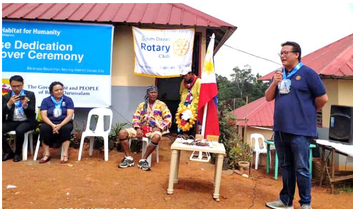
RCSD Free feeding, distribution of food packs and turnover of 47 houses with the Habitat for Humanity to the Matigsalog Tribe in Marilog District in partnership with the Government and People of Brunei Darussalam. Sept. 28, 2019